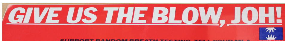
Pictured above: An example of campaign materials from the 1970s

Due to the fragility of many of our unique holdings, these items can only be displayed for short periods of time. Luckily we took plenty of photos!