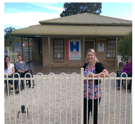
Hillbank Office (After)